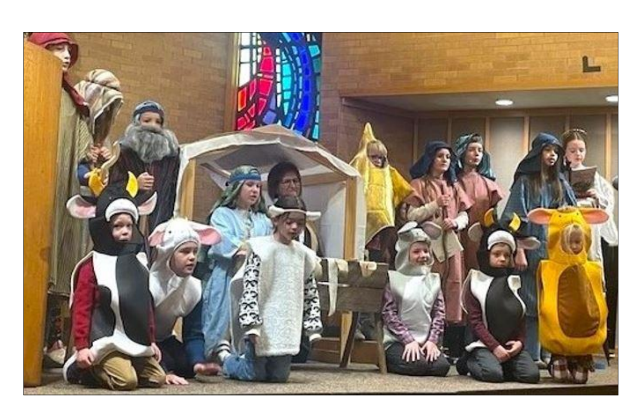
Christmas pageant rehearsal.