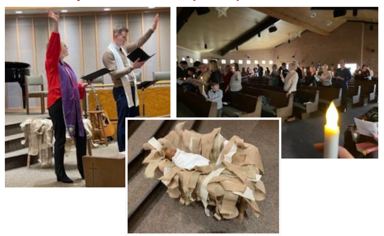
5pm Christmas Eve Candlelight Service with Communion