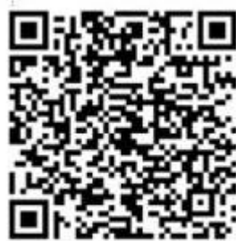
FPC Musician Survey

If you are a musician (of any skill level—all gifts can be used to worship God!), I would love it if you could fill out this brief survey so I can incorporate your gifts in the worship of the church.