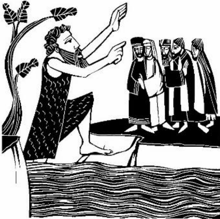
In Memoriam - John the Baptizer

Worshipping, serving, and living with a fresh vision of God's vibrant energy and grace for all.